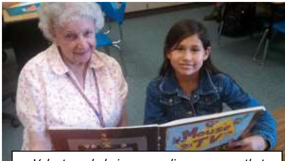
Volunteers help in our reading programs that support student achievement!

Our school district welcomes our families, our cultures and races, and our religions. We encourage parents, senior citizens, and other interested adults to volunteer in our schools. There is great reward in helping a child learn to read or become confident in math or science. The result of student success is a better world for everyone. We definitely see the results in our hometown because we have many of our graduates taking community roles of leadership here at home and in school.