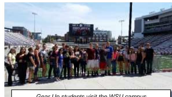
Gear Up students visit the WSU campus