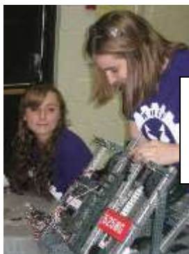
Students prepare to compete in a Gear Up-supported VEX robotics competition